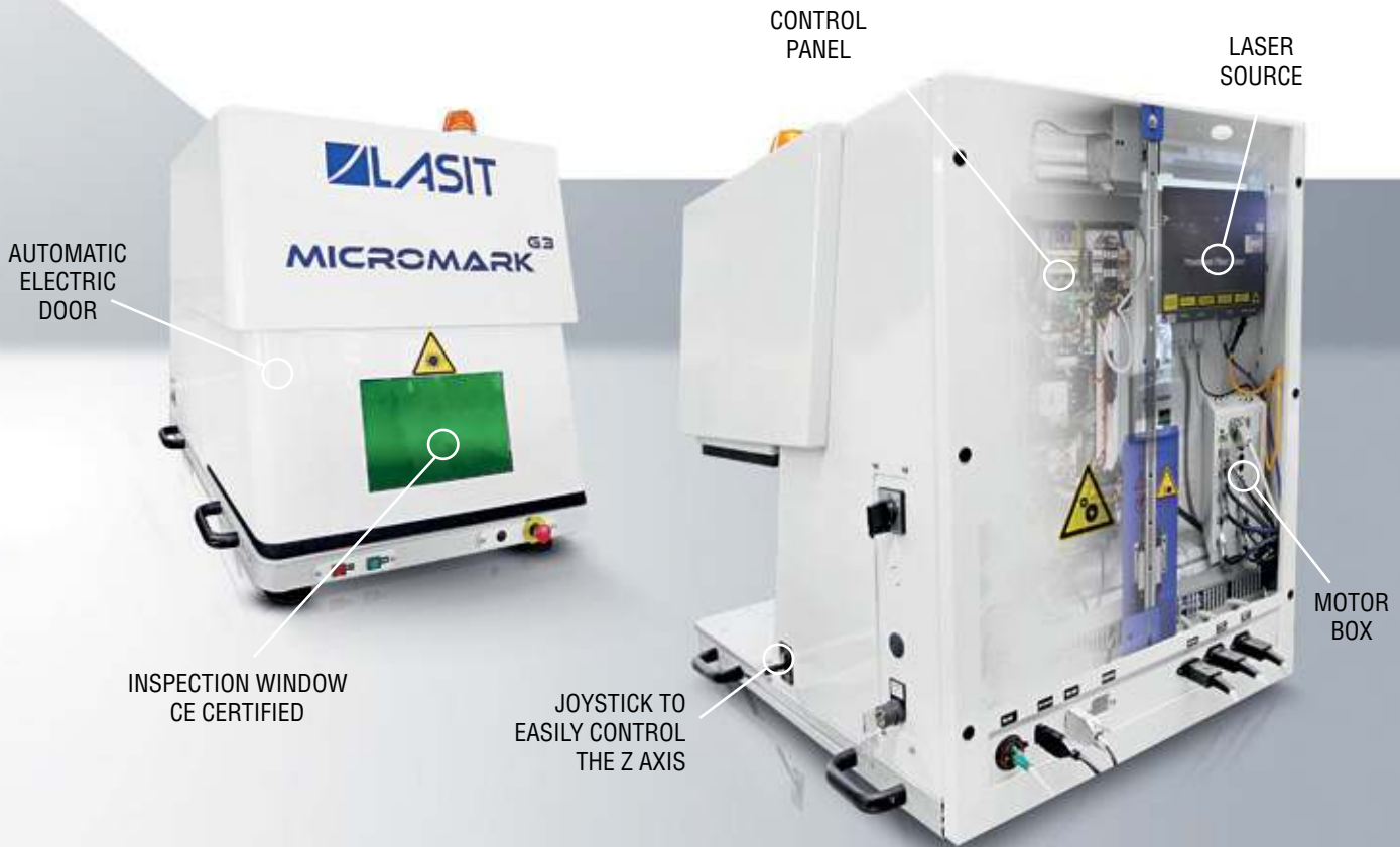
OPENINGS ON THREE SIDES

the desktop laser marker totally integrated